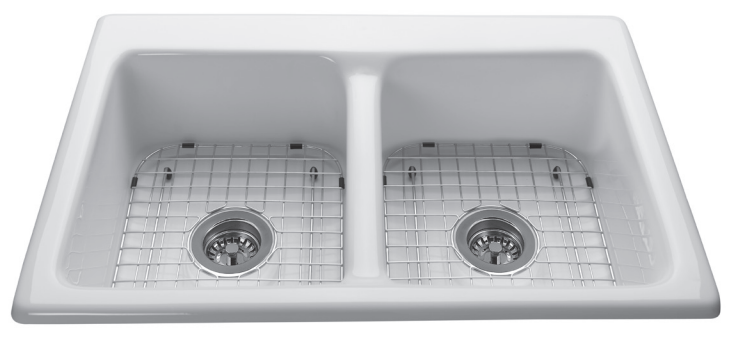
Optional sink grids shown above.

NOTES: Measurements are ±1/2" and are subject to change without notice. Data herein supersedes all previous prior to publication date indicated below.