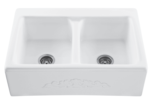
Available with plain or embossed apron at no charge. Please specify when ordering.