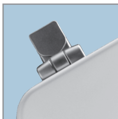
METAL WHISPER•CLOSE® WITH EASY•CLEAN & CHANGE® HINGES