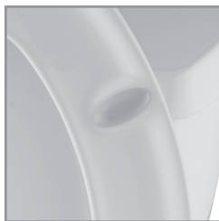
NO-SLIP LUXURY BUMPERS