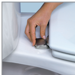
TWIST HINGES TO UNLOCK