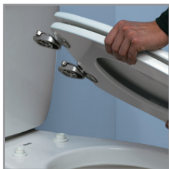
EASY REMOVAL OF SEAT FOR THOROUGH CLEANING