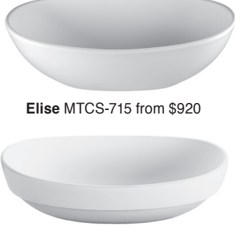
Elise SR MTCS-714 from $920

For more information about Engineered Solid Stone lavatory sinks, please visit mtibaths.com or see section "F" in the MTI binder.