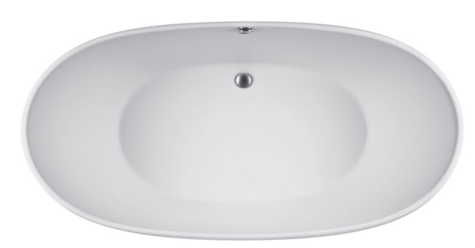
Inside view of tub.

in chrome finish. Also available in brushed nickel, polished nickel or special finishes*.