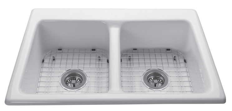
Optional sink grids shown above.

NOTES: Measurements are ±1/2" and are subject to change without notice. Data herein supersedes all previous prior to publication date indicated below.